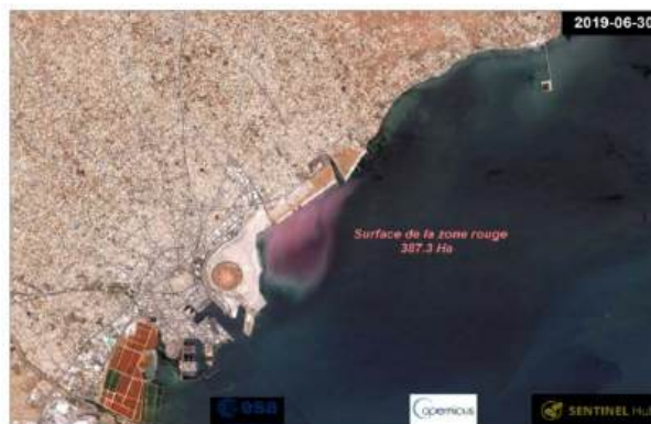
Image1: Algal bloom in Sfax coastal waters

This paper discusses how coastal zones observations with remote sensing techniques can and permit the analysis and survey of different phenomenon progresses.